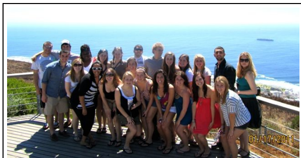
2011 Cape Town Study Abroad students